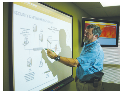
ASD Customer Technology Center

We'll use the Technology Center to design, build, and test your solution using data sourced from your internal business system. Then we'll provide access to the web based reports to allow users to "test drive" the BI solution. We've installed the latest products from IBM, Cisco and Microsoft to provide a leading edge hosting service for BI proof of concepts and BI solutions.